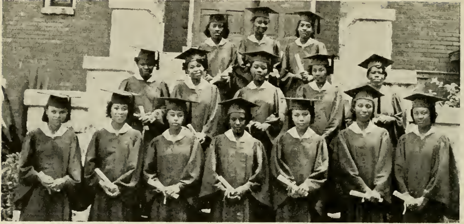
At Boylan-Haven School, those in charge have "to turn girls away by the dozens"

Work, Book Week, and National Education Week, when outside speakers as well as students and faculty members participated.